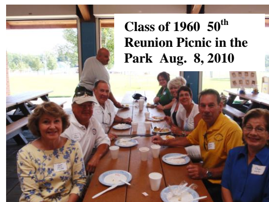
Class of 1960 50 th Reunion Picnic in the Park Aug. 8, 2010